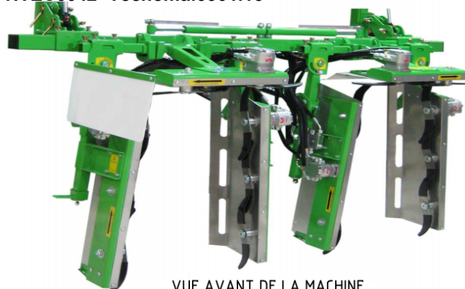
VUE AVANT DE LA MACHINE

Planche: NTEC0041-Tecnomat:9901.17 NTEC0042- Tecnomat:9901.16